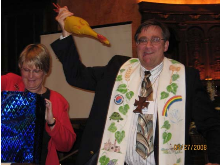
for Rex's comedy routine!