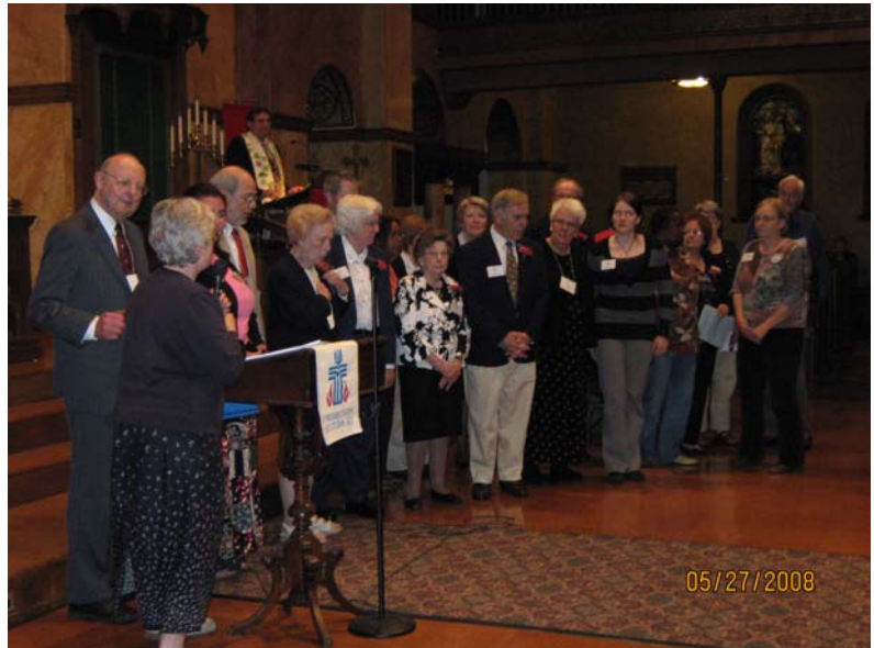
The New "First Church"