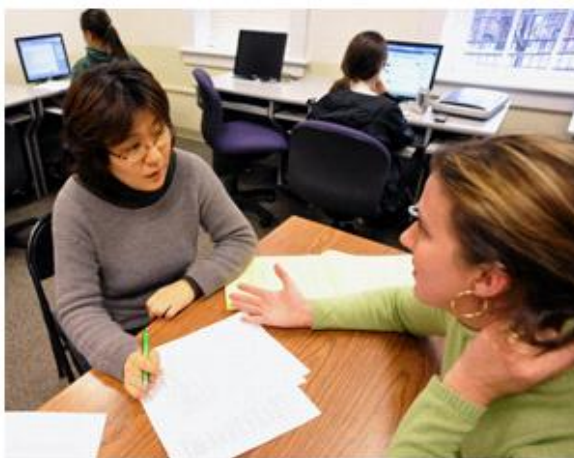
A student works with a financial aid officer at Mary Baldwin College

The PC(USA)'s Student & Parent Loan Programs remain open for application through July 31 for the 2010-11 academic year. Student Loans are offered with interest deferred while the student remains enrolled at least half-time. These loans are recommended for students who need private or PLUS loans in addition to their federal student loans. Parent Loans will be awarded to parents or guardians of students in order to meet the family contribution for a student's educational expenses. In order to apply, students must first apply for financial aid from the college or university they plan to attend. For detailed information on interest rates, eligibility criteria, or to download an application, please visit the Financial Aid for Studies website or send an email .