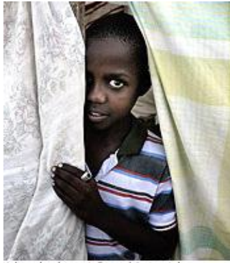
A boy looks out from his tent home following the earthquake. Many survivors are living in tents in this park in Petionville, Haiti.

Haiti Relief and Recovery - We continue to be amazed and inspired by Presbyterians' outpouring of care and generosity for the people of Haiti.